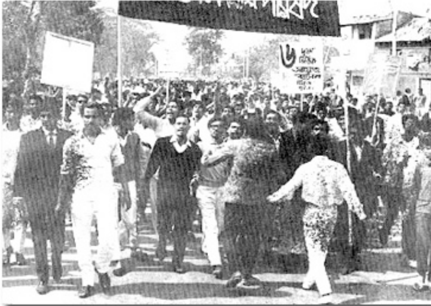
Cantral student unit protest after parlament was prospone

The most glorious event of Bangalee history. Our tribute to 3 million Bangalee lives for the independence of Bangladesh