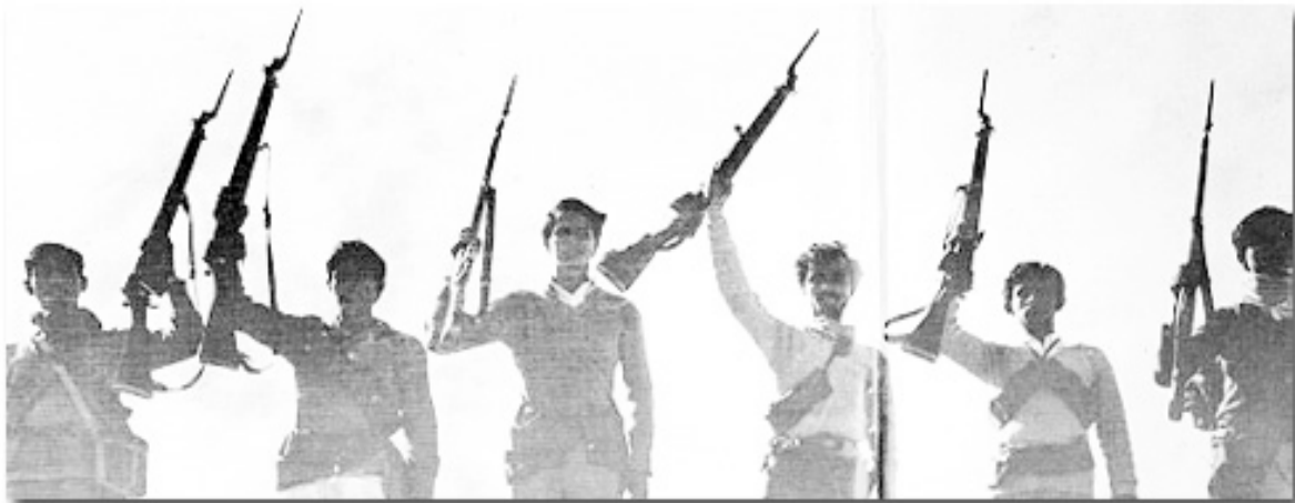
Mukti at shaid minar