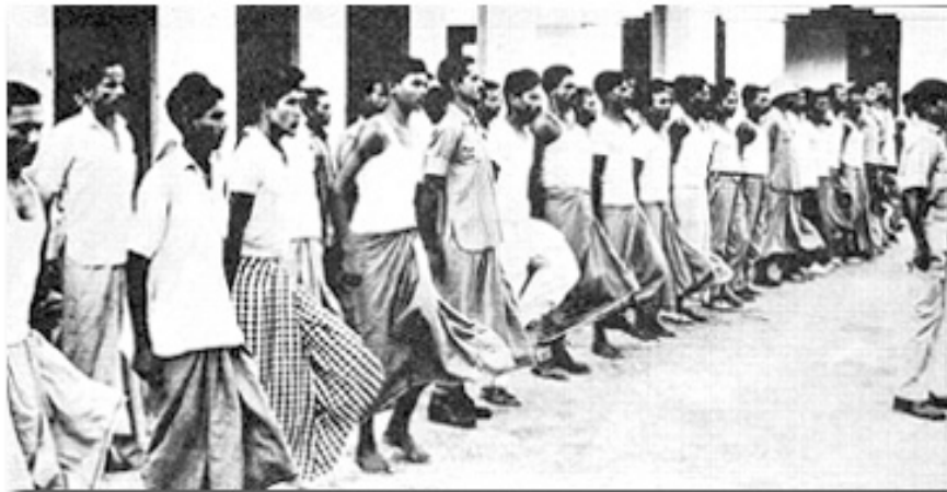
The rural Bangalee youth are training for the independence war